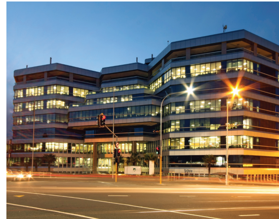
ARC Headquarters, 21 Pitt Street, Auckland CBD